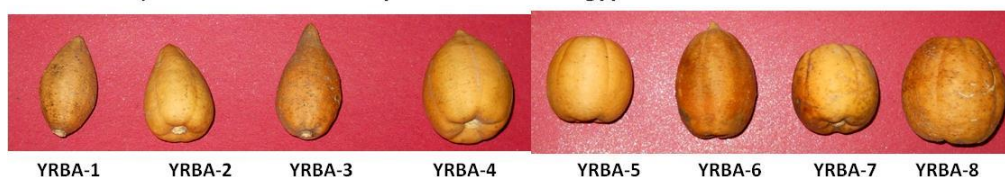
b) Variation in fruit end shape of Balanites aegyptiaca – Vertical view